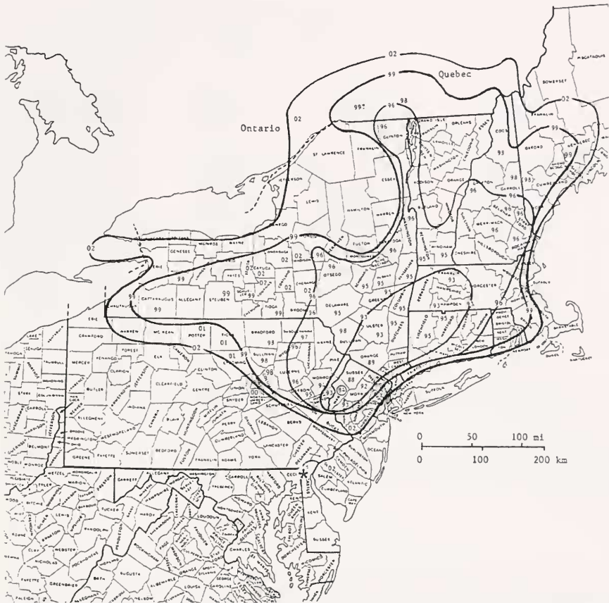
Figure 1. The known distribution of Peristennus digoneutis in the northeastern United States and southeastern Canada as of March 2003. This map is from Day et al. 2000, updated by an additional 13 county records obtained in 2000–2002 (locations and dates are in Table 1). The Canadian records are from Broadbent et al. 1999. The numbers in the counties indicate where and when the first recovery was made. In most cases, this was the first attempt to detect this species, so it had arrived earlier. The heavy lines depict the probable dispersion of the parasite by 1993, 1996, 1999, and 2002.